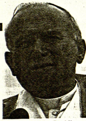
Pope John Paul II